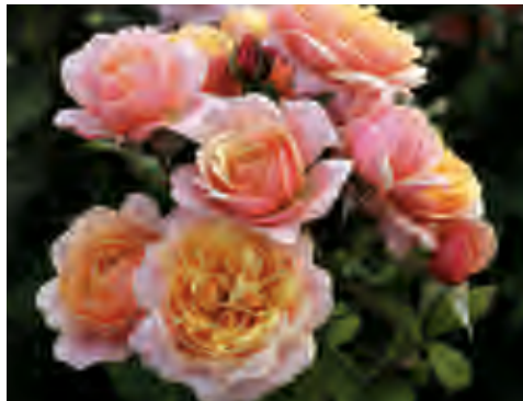
STATE OF GRACE™ , Hybrid Tea. A compact plant with soft apricot-gold blooms with a dark pink reverse. Moderate fruity fragrance, glossy green foliage.....$34.99

STAINLESS STEEL™ , Hybrid Tea. This 'everyday' version of Sterling Silver is much easier-to-care-for, much easier-to-grow and has much longer-lasting flowers. Yet it still possesses the wonderful perfume and the mysterious pastel color that places its ancestor in rose history. Classic show form with nice long stems. Steely-white with hints of pale lavender to subtle pink. Flower size & color are best with some cooler temperatures. 🦋.....$34.99