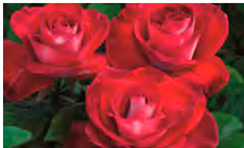
SMOKIN' HOT® , Hybrid Tea. Fiery orange-red petals with a smoky purple overlay on a handsome, tall plant. Unique color.....$34.99

STAINLESS STEEL™ , Hybrid Tea. This 'everyday' version of Sterling Silver is much easier-to-care-for, much easier-to-grow and has much longer-lasting flowers. Yet it still possesses the wonderful perfume and the mysterious pastel color that places its ancestor in rose history. Classic show form with nice long stems. Steely-white with hints of pale lavender to subtle pink. Flower size & color are best with some cooler temperatures. 🦋.....$34.99