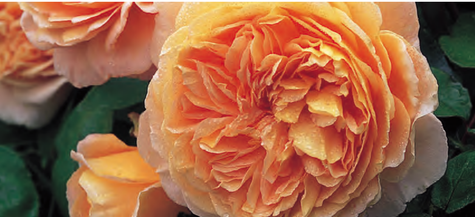
Crown Princess Margareta, located in the David Austin English Rose section.

HYBRID TEA GRANDIFLORA FLORIBUNDA SHRUB RUGOSA CLIMBING ENGLISH MINIFLORA MINIATURE PATIO TREE MINIATURE TREE