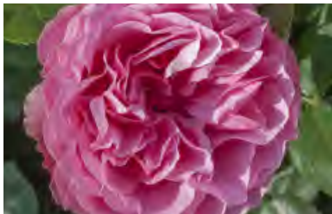
LEONADRO DA VINCI® †, Floribunda. This romantic pink rose has large clusters of flowers that are very full and quartered. The fragrance is a mild tea scent, and to top it all off, it offers excellent disease resistance for the type..... $24.99