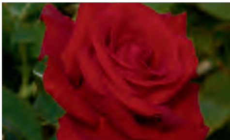
DROP DEAD RED™ , Floribunda. Rich velvet red on dark glossy leaves really pops! The rich red color lasts to the finish. Medium habit. Slight, sweet fragrance..... $29.99