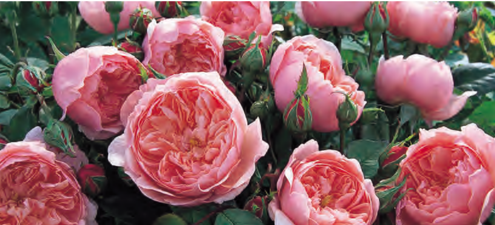
The Alnwick® Rose, located in the David Austin Rose section.

HYBRID TEA GRANDIFLORA FLORIBUNDA SHRUB RUGOSA CLIMBING ENGLISH MINIFLORA MINIATURE PATIO TREE MINIATURE TREE