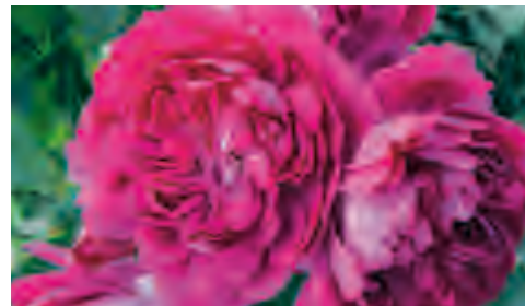
SULTRY NIGHT™ , Shrub. Features large flowers in magenta pink with hints of blue. Each petal has a lighter reverse, adding a mystical shine to this shrub rose and an unforgettable heat to the garden. While the 3” blooms are smaller than some Floribunda roses, clusters of eight to fifteen large blooms open at once for a fairytale display of color. Sultry Night features a sweet grapefruit fragrance that only adds to the desirability of its cut flowers. Resistant to powdery mildew and rust, this magical rose shrub will have you spellbound. NEW ..... $24.99