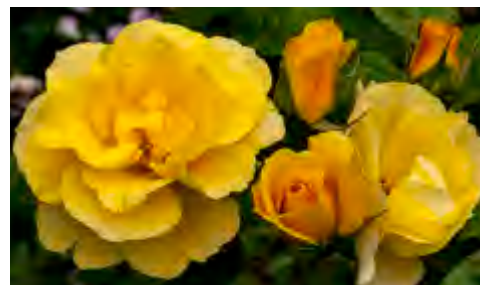
TEQUILA® GOLD† , Shrub. A symphony of bright yellow color almost non-stop throughout the season. It is an exceptional rose with a vigorous and bushy growth habit. The dense, dark green foliage contrasts nicely with the yellow flowers. NEW ..... $24.99