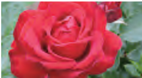
DESMOND TUTU™ SUNBELT® †, Floribunda. Large, elegant, deep-red flowers opening from high-centered buds. Flowers bloom in clusters and as singles throughout the season. Glossy, disease-resistant, dark-green foliage. Gold medal winner in international competition – Best Shrub Rose 2012. NEW ..... $29.99