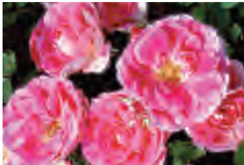
CAREFREE WONDER† , Shrub. Recurrent semi-double, pink blooms on disease resistant, hardy shrub. 1991 AARS winner..... $24.99