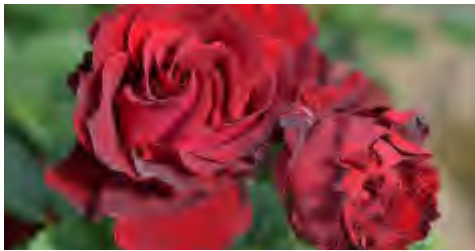
DANCING IN THE DARK™ , Floribunda. Intense deep red blooms developing to almost black with a bushy upright habit. A head-turner in any garden..... $29.99