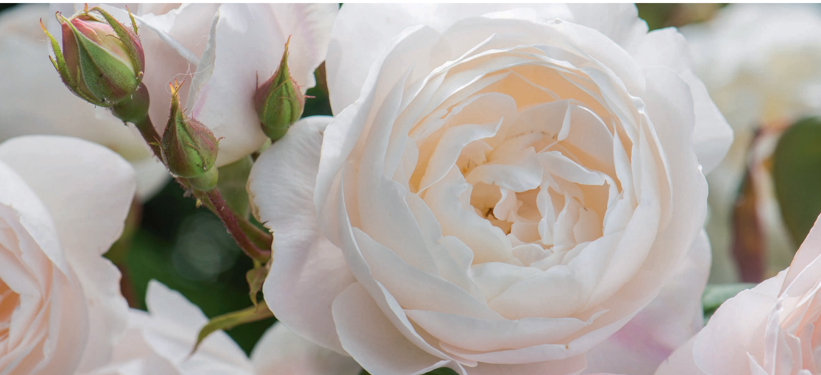
Desdemona , located in the David Austin Rose section.

HYBRID TEA GRANDIFLORA FLORIBUNDA SHRUB RUGOSA CLIMBING ENGLISH MINIFLORA MINIATURE PATIO TREE MINIATURE TREE