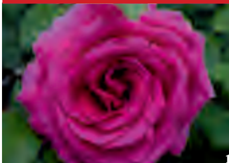
MIRANDA LAMBERT , hybrid tea. Medium-tall. Fully double with rich grey-green foliage. Phenomenal fragrance, big blossom over five inch in diameter. Hot pink color. ..... 24.99

MISS ALL-AMERICAN BEAUTY , large, very full deep hot pink, strong tea rose fragrance. 1968 AARS winner ..... 19.99