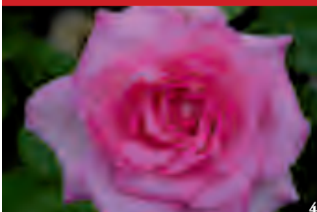
BEVERLY , Hybrid tea. Pink flowers, large blooms and strong fragrance. ..... 24.99

DEE-LISH , hybrid tea. Large, deep non-fading pink blooms with very strong verberna/citrus fragrance. NEW ..... 24.99