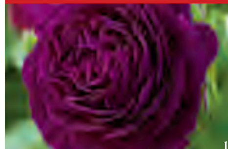
TWILIGHT ZONE , large old-fashioned, fully double blooms of deep velvet purple with intense clove and lemony citrus blossom fragrance. Dark green foliage covers a medium rounded, slightly spreading bush. ..... 24.99