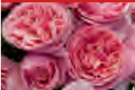
ALL DRESSED UP , Grandiflora. Globular quartered and double pink blooms on a medium-tall plant. Mild tea fragrance. NEW ..... 24.99