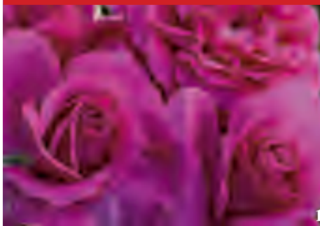
PRETTY LADY ROSE , hybrid tea. Medium. The long lasting large flower coloration is enhanced by the sweet scented peony and spices fragrance. Dark even pink ..... 24.99

QUEEN ELIZABETH , Grandiflora, profuse, long-stemmed clusters of clear pink, full blooms, tea rose fragrance. The first Grandiflora rose. 1955 AARS winner ..... 19.99