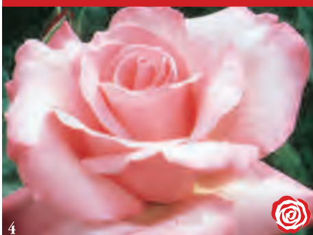
FIRST PRIZE , top exhibition rose. Large, high centered blooms of blended rose pink. 1970 AARS winner ..... 24.99

FRANCES MEILLAND ™ , named to honor the 100th birthday of the breeder of the famous "Peace" rose, this tall, stately bush is the first hybrid tea to win an AARS award under no-spray conditions, as well as the German ADR award under similar trials. High centered, fully petaled, luminous shell pink blooms on long stems with intense strong fruit and citrus perfume. A true breakthrough in hybridizing. 2013 AARS winner ..... 24.99