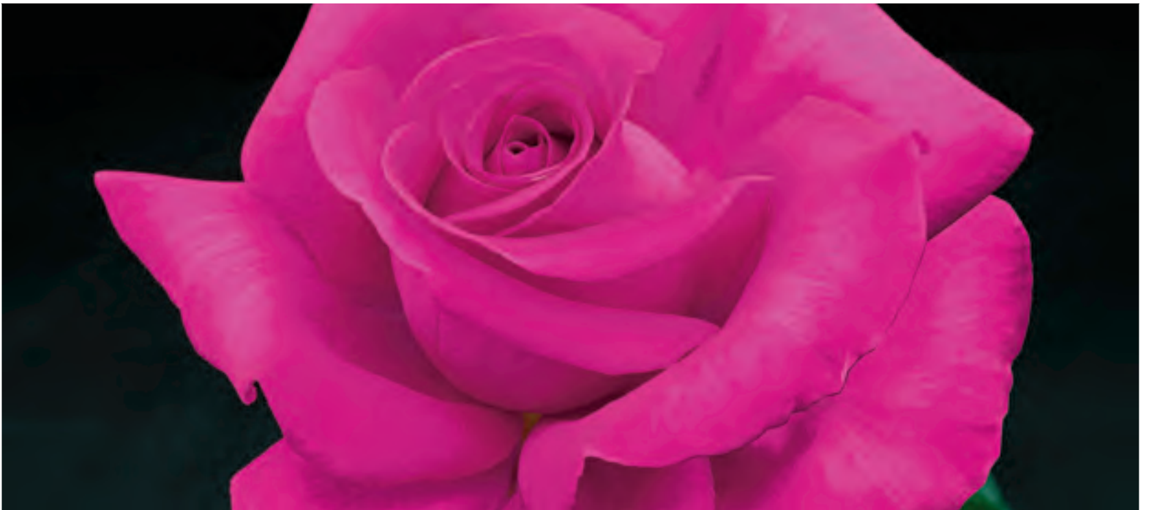
All My Loving (FRYrapture), located in the Hybrid Tea Rose section.

HYBRID TEA GRANDIFLORA FLORIBUNDA SHRUB RUGOSA CLIMBING ENGLISH MINIFLORA MINIATURE PATIO TREE MINIATURE TREE